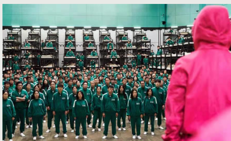
Netflix's South Korean sensation Squid Game has been criticised for its subtitling inaccuracies.